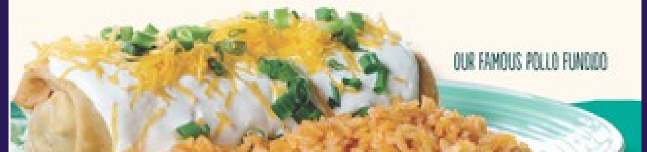
OUR FAMOUS POLLO FRITO